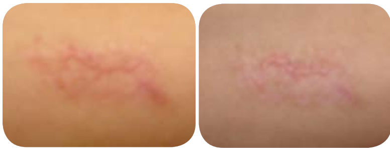
Before (Scar on arm from skin graft)

The downtime varies depending upon treatment focus. See results after one treatment below.