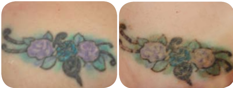
Before (10-yr old tattoo on chest)